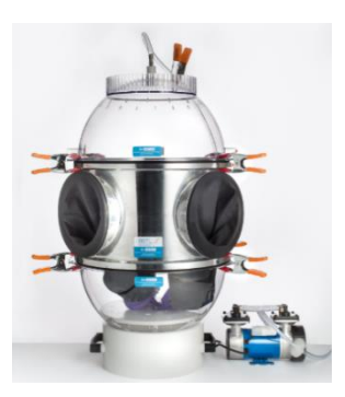
Figure 1: BSTL Chamber

Figure 1 shows the BSTL chamber, which is a replica of NIOSH test chamber. Only "connector's parts" of the perfusion line are present in the NIOSH chamber during the test.