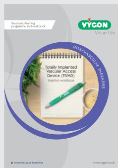
TIVAD A4 Insertion Workbook V00745v1 x1 off