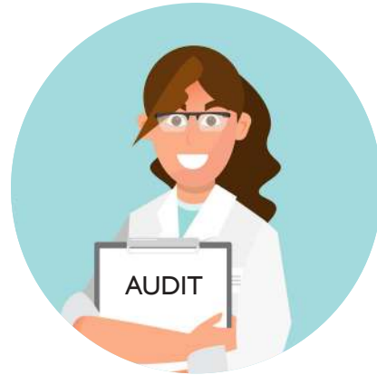
Audits and departmental support