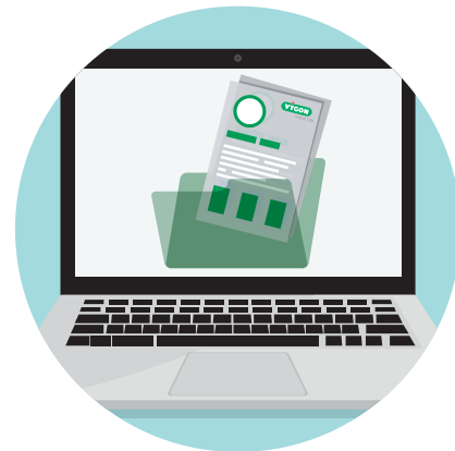
Product support and information