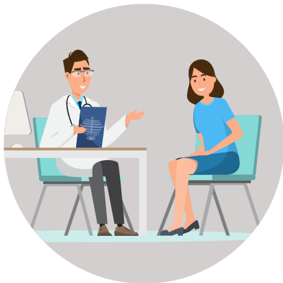
Patient support and education