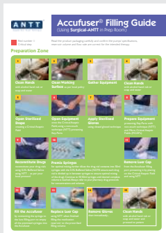
accufuser Surgical ANTT A5 Leaflet V00716v1 x1 off