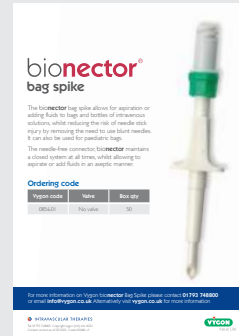
bionector Bag Spike A4 Poster V00686v2 x1 off