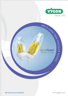
accufuser Patient Guide V00089v2 x1 off