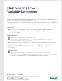
accufuser Flow Variable A4 Leaflet V00715v1 x1 off