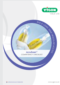
accufuser A5 Competency Checklist V00129v1 x1 off