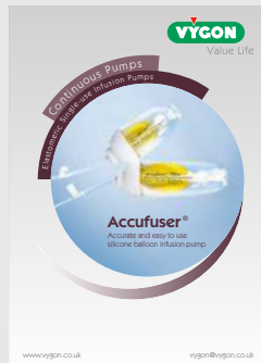
accufuser Product Guide V01131v4 x1 off