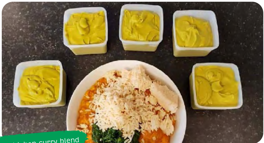
A chicken curry blend

We hope you find it useful in your Blended Diet journey.