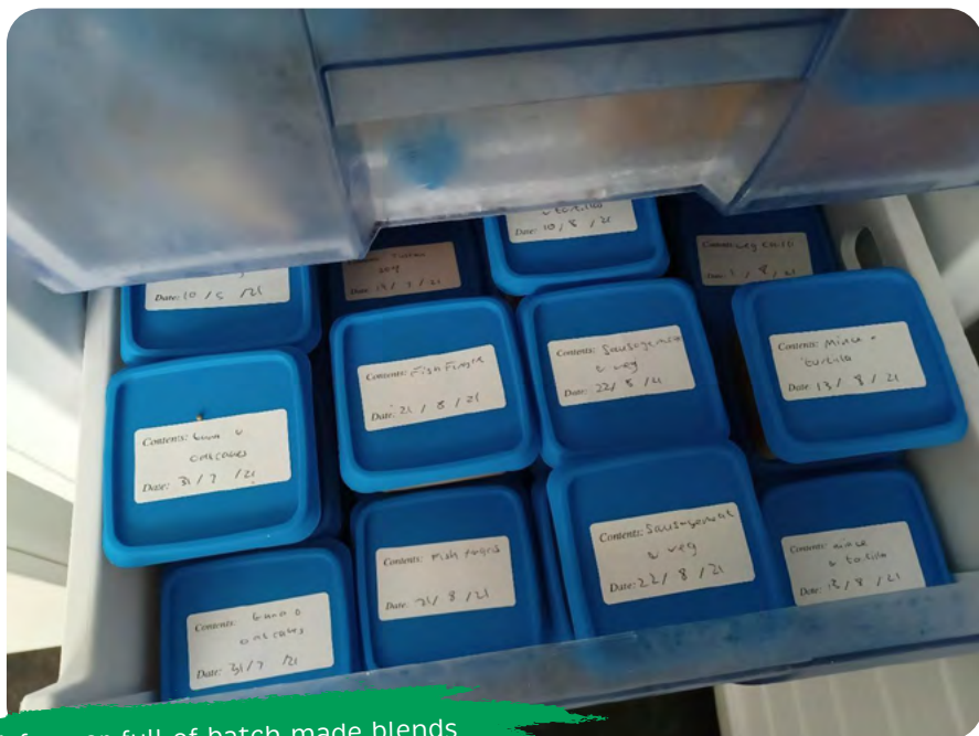
A freezer full of batch made blends

Although blended diet takes more time and planning in comparison to ready to hang formula many parents enjoy being able to shop, prepare and cook for their tube-fed child.