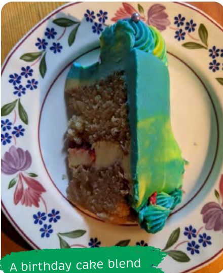
A birthday cake blend